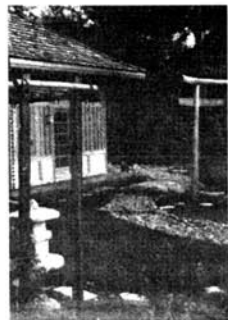
Fresh air - A tori gate in the traditional Japanese garden calms the soul.

The idea for building and creating the pavilion and garden came from their trips