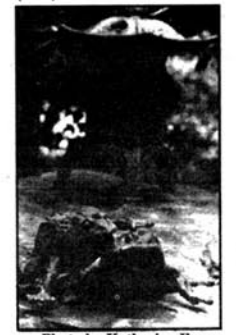
Serenity - Sculptures in the Shakunage Cultural Foundation promote harmony